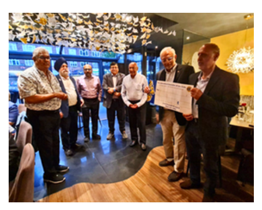
Chipping Barnet and Mill Lions Club held a social meeting to present a cheque to VICTA.