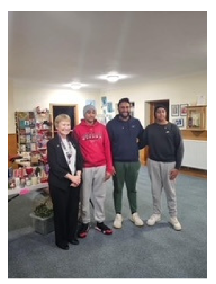
It was a pleasure to attend the induction of two new Bedford Lions.

Thank you all for what you do; thank you for wearing the Lions Badge with such pride.