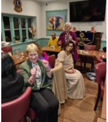
Presenting Banners at Hatch End meeting and later in the same evening having fun playing musical chairs at their Diwali Party.