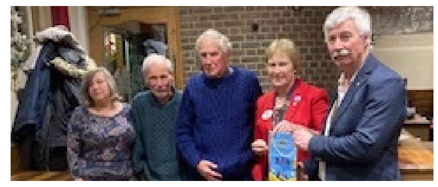
I had a lovely time at Tring Lions Club's Charter.