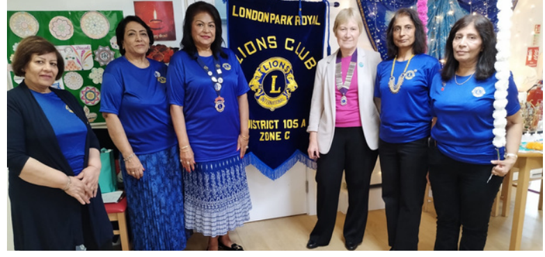
A wonderful time was had at the Park Royal Diwali Lunch for those living with dementia.